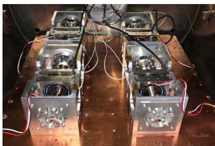
“BBT2”: 4 setups using frameless motor to test a pair of preloaded bearings, for long term and down to swivelling motions.

Post-Analysis may cover measurement of wear by profilometry, SEM or microbalance, investigation of surface structure or material transfer by SEM/EDX.