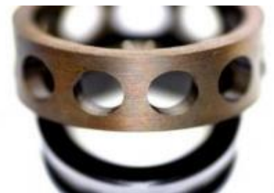
Figure 2: Images of cages: made of Self-Lubricating Polymer (left and middle), made of copper MMC (Right)