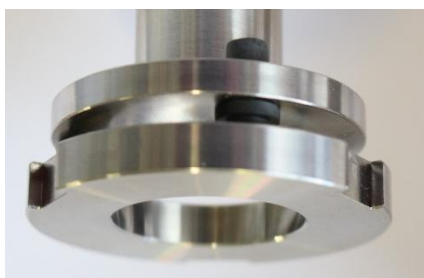
Lower Ring and 3 Pins