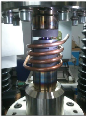
Image of the Forming Tribometer: showing the Ring-On-Plate-Specimens with inductive heating system (not in position)

Post-Analysis may cover measurement of wear by topographic means. Investigation of surface morphology or material transfer by SEM/EDX. Changes in the subsurface microstructure can be analysed locally resolved by EBSD (Electron Back Scattering Diffraction).