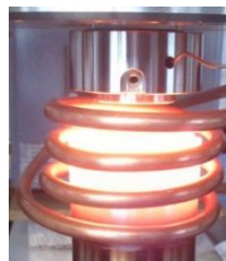
inductive heating of ring