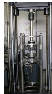
the whole test device