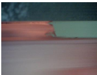
Ring at end of forming test